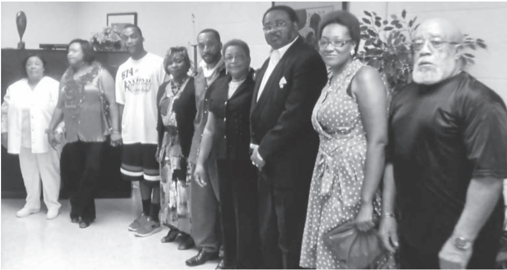
CAST OF "OUR GREATEST NEED"