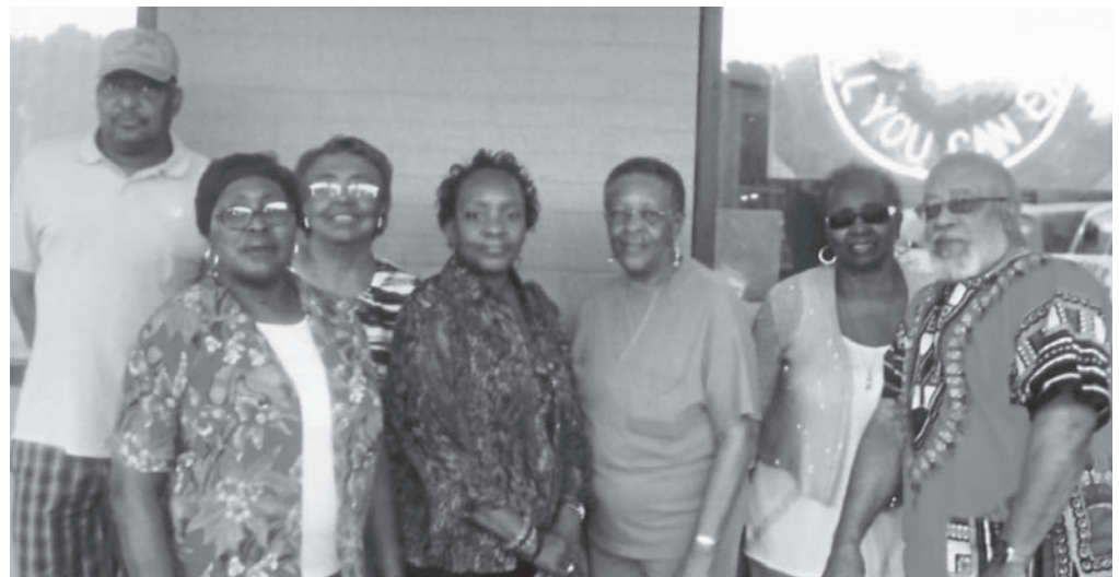
SENIOR MINISTRY ENJOYS SUMMER ACTIVITIES