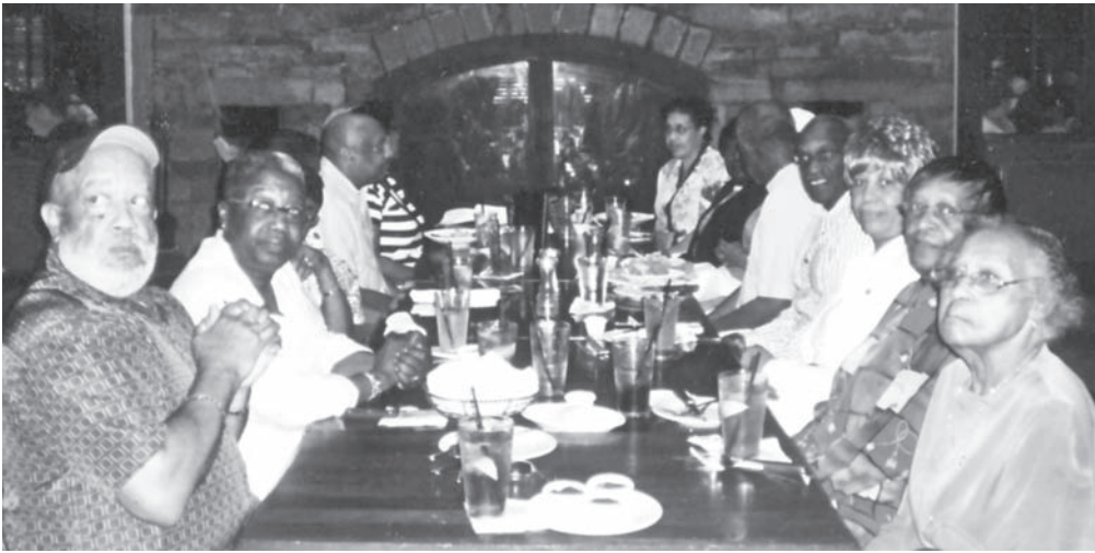
SENIOR MINISTRY DINE AND FELLOWSHIP