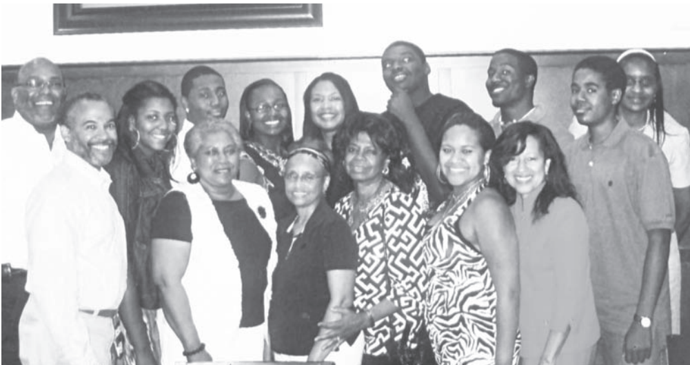
CHILDREN'S CHURCH COMMITTEE HOSTED LUNCHEON FOR VOLUNTEERS

(Continued Page 2, Columns 2 & 3, Article 3)