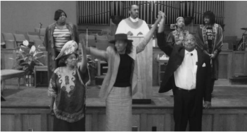
THE CAST OF "JUDGE YE NOT"