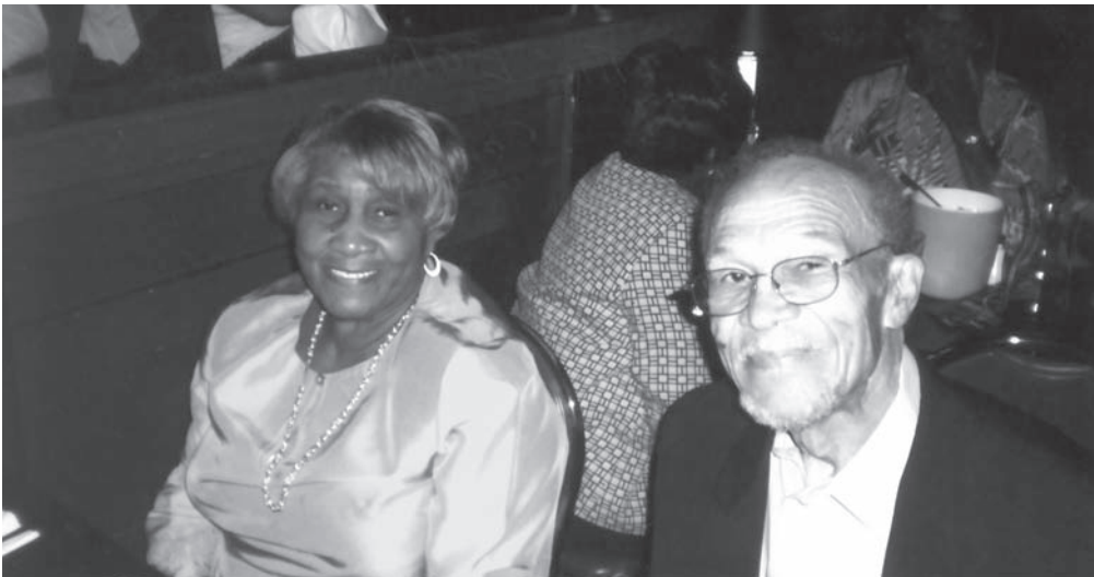
THE EATONS OF THE SENIOR MINISTRY ENJOY A DINNER AND A PLAY

The play was titled Love Machine - The Musical . "Sweet Daddy" was the star of the high energy show that took us down memory (Continued Page 3, Column 2, Article 3)