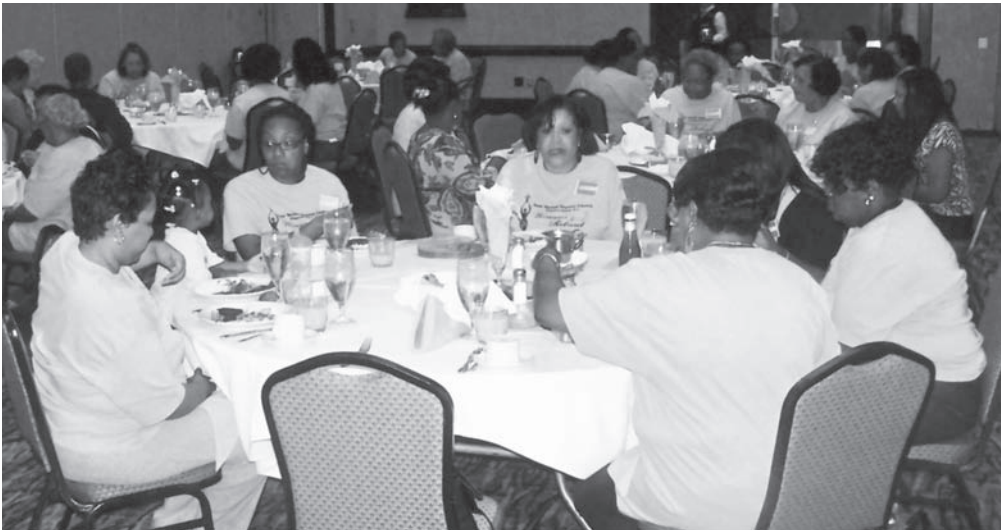
THE WOMEN'S RETREAT MEMBERS ENJOY A HEARTY BREAKFAST TO START THEIR DAY