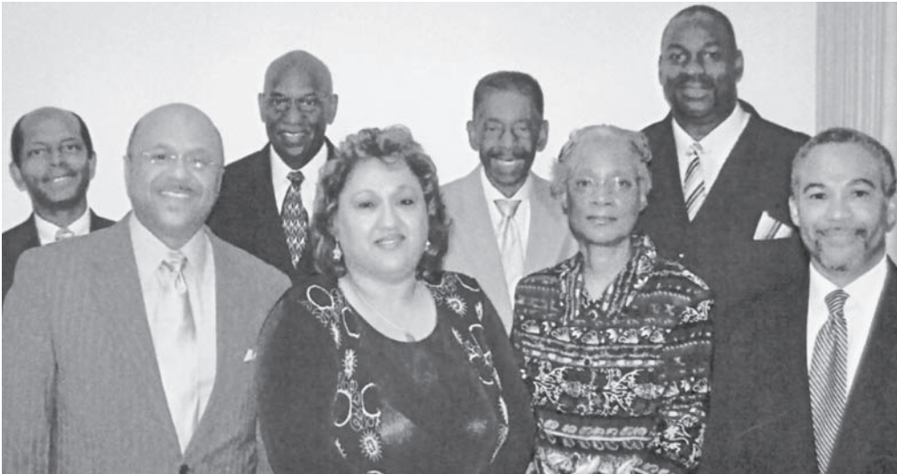
NEWLY ORDAINED DEACONS