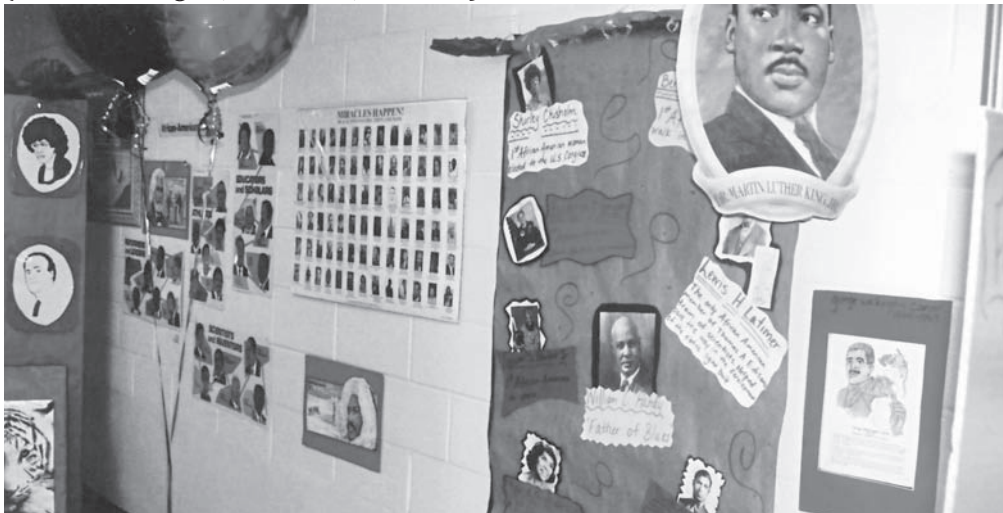
BLACK HISTORY EXHIBIT