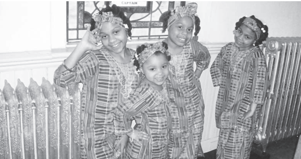
YOUTH DRESSED IN AFRICAN ATTIRE

The committee served refreshments following the presentations. They wanted the audience to browse the exhibits just as in a museum. The committee wanted to share historical facts so that our youth can know the contributions and struggles through which our ancestors have come.