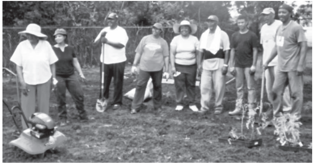
HEALTH MINISTRY PLANS AND PREPARES VEGETABLE GARDEN