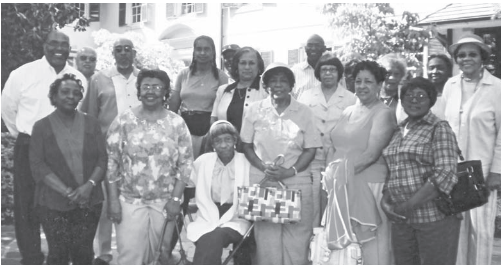
SENIORS ENJOY OUTING AND DINNER