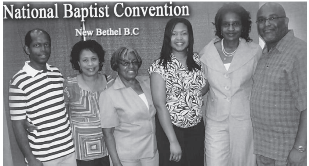
DELEGATES TO 105TH CONGRESS

The delegates were taught in a classroom setting. Each session was designed to challenge and convict each participant to be better disciples (Continued Page 3, Column 3, Article 2)