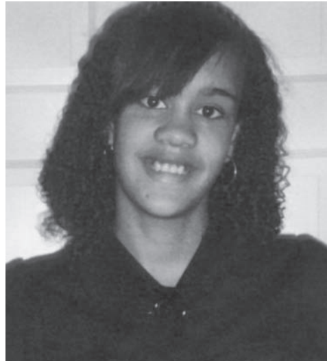
ESCADA S. HORTON YOUTH OF THE MONTH