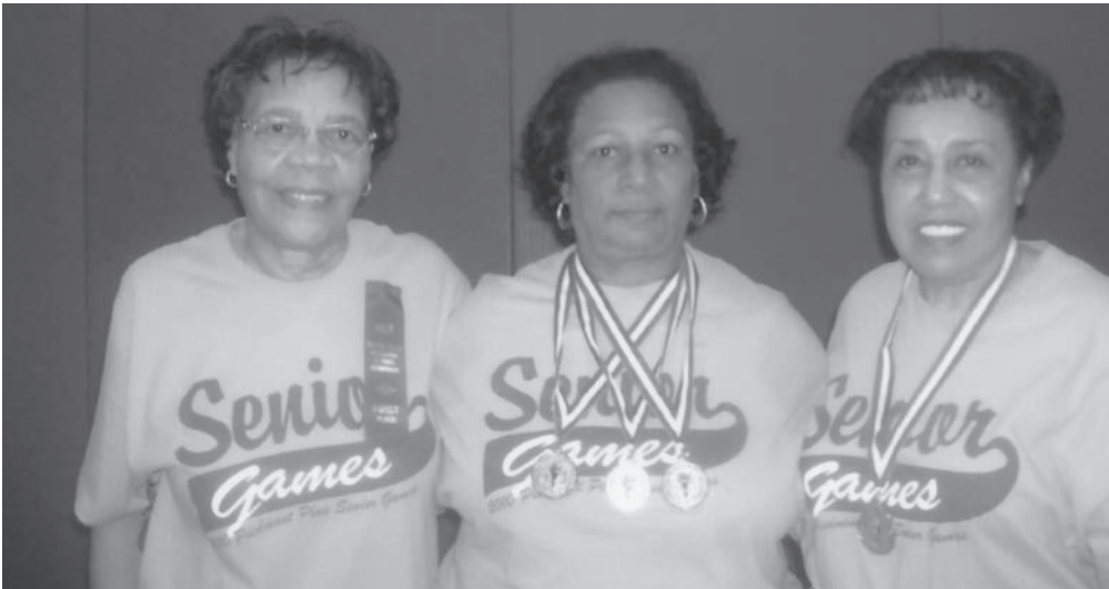
PIEDMONT PLUS SENIOR MEDAL WINNERS