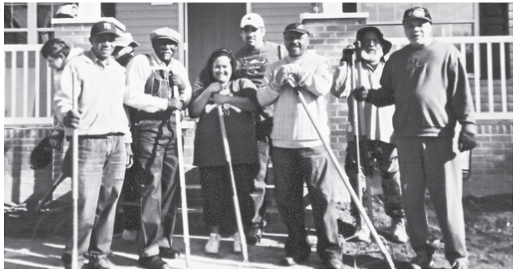
LAYMEN'S LEAGUE ASSISTS HABITAT FOR HUMANITY

Masterful performances, a celebration of the Gospel, and plenty of wonderful Christmas music lifted unto you, our Heavenly Father for sending Jesus Christ your son. Amen.