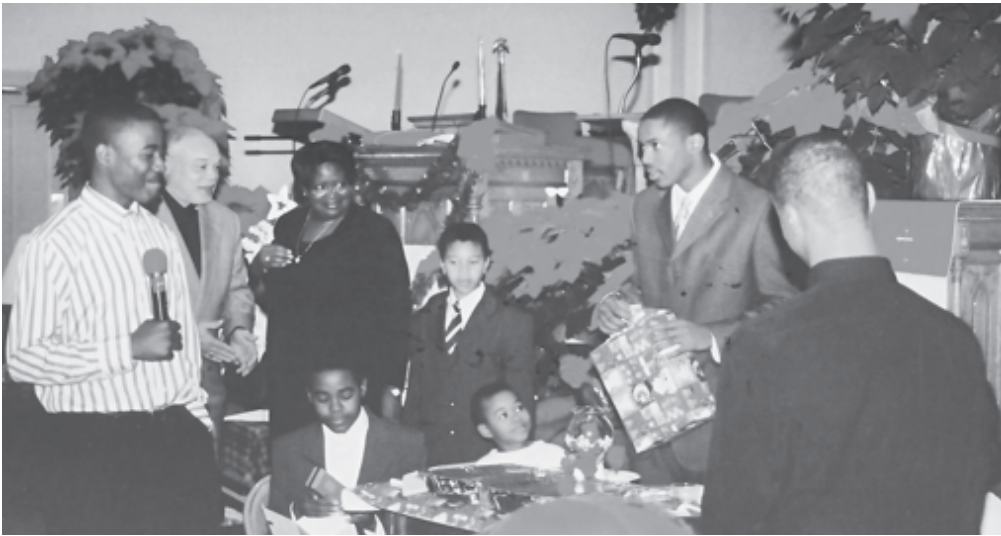
SUNDAY SCHOOL CHRISTMAS PROGRAM PARTICIPANTS