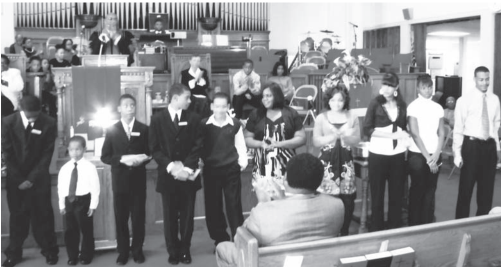
FIRST QUARTER HONOR ROLL STUDENTS