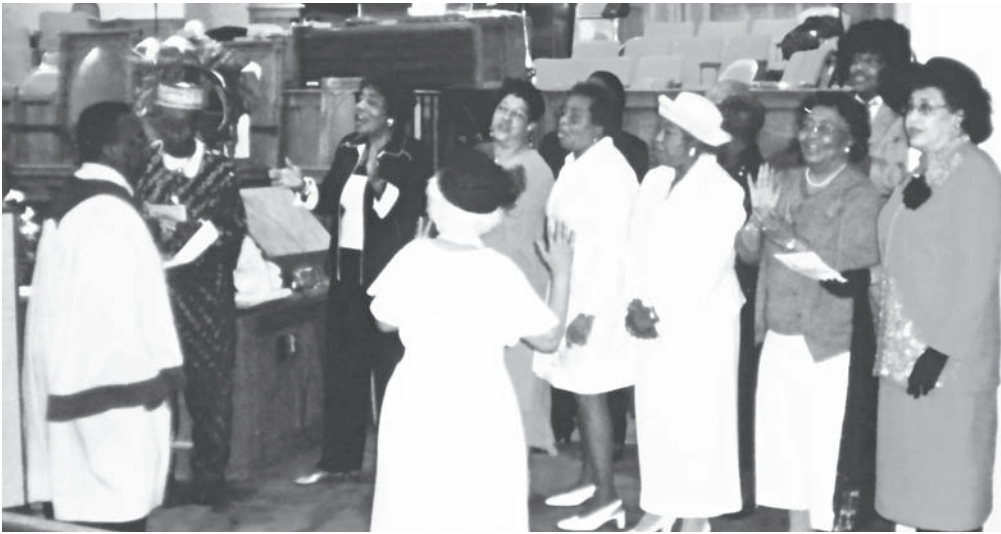
CAST OF TWELVE GATES TO THE CITY