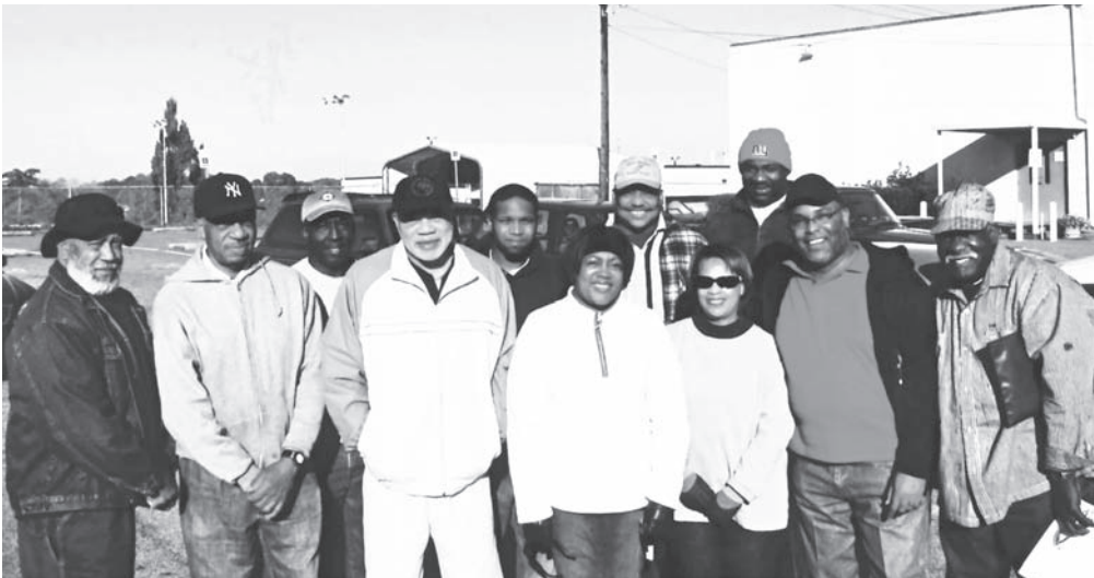
LAYMEN VOLUNTEER AT HABITAT

A great big thank you to all the volunteers for making this year's build the best.