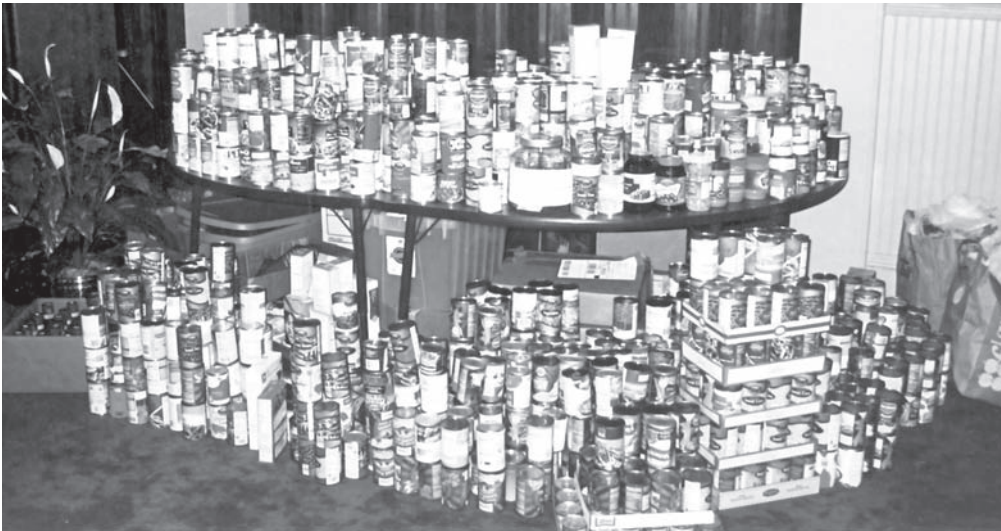
FOOD DRIVE COLLECTION