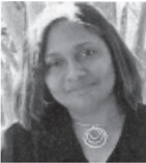
MINISTER ZENOBIA FENNELL MISSIONARY DAY SPEAKER