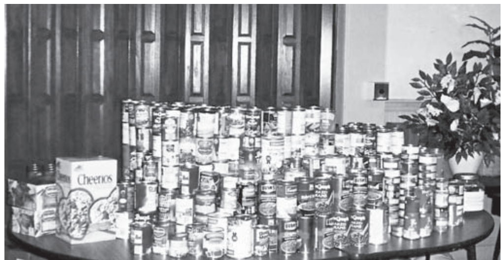
CAN COLLECTION DISPLAY DURING FOOD DRIVE

On Monday before Thanksgiving, the truck from the Second Harvest Food Bank arrived and picked up ten boxes of food. Thanks to the entire membership of New Bethel Baptist Church for participating in the food drive. It was a big success. The goal was to collect 1000 cans/items. We collected 1338 cans/items and $300.00 in monetary donations. All items were donated to The Second Harvest Food Bank of Northwest NC. The graphs and charts are posted on the wall in the annex. Please go by to see the final results on the numbers of cans collected by the Sunday school classes and Church.