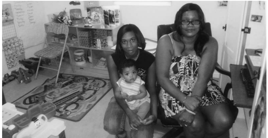
GULLICK'S CHILDCARE HOME RECEIVES TOP RANKINGS

Their motto is the scripture, Proverbs 22:6—"Train up a child in the way he should go, and when he is old, he will not depart from it." They are now enrolling!