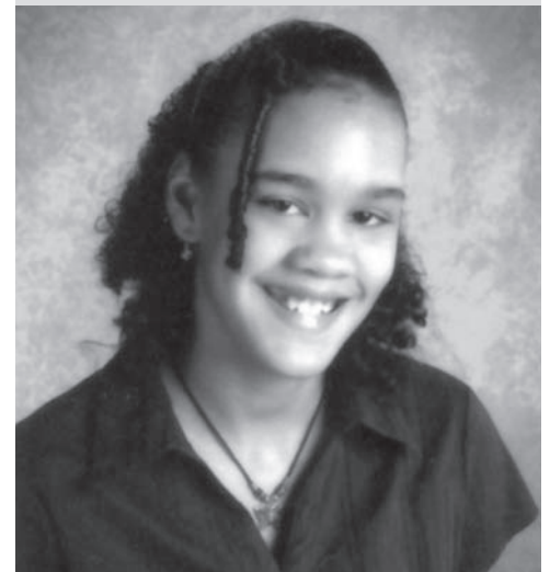
ESCADA HORTON YOUTH REPORTER