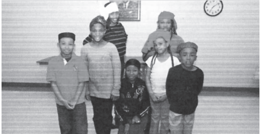
YOUTH MINISTRY ENJOYS AFRICAN EXPERIENCE